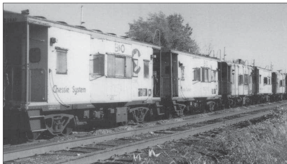
The end of the line for B&O — C&O cabooses

The association leads the way to end Alzheimer's and all other dementia – by accelerating global research, driving risk reduction and early detection and maximizing quality care and support.