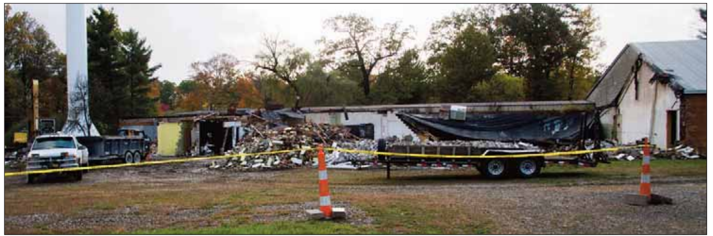
THE MADISON TOWNSHIP TRUSTEES hired H and T Demolition of Mansfield to remove the old township building located on Expressview Dr.