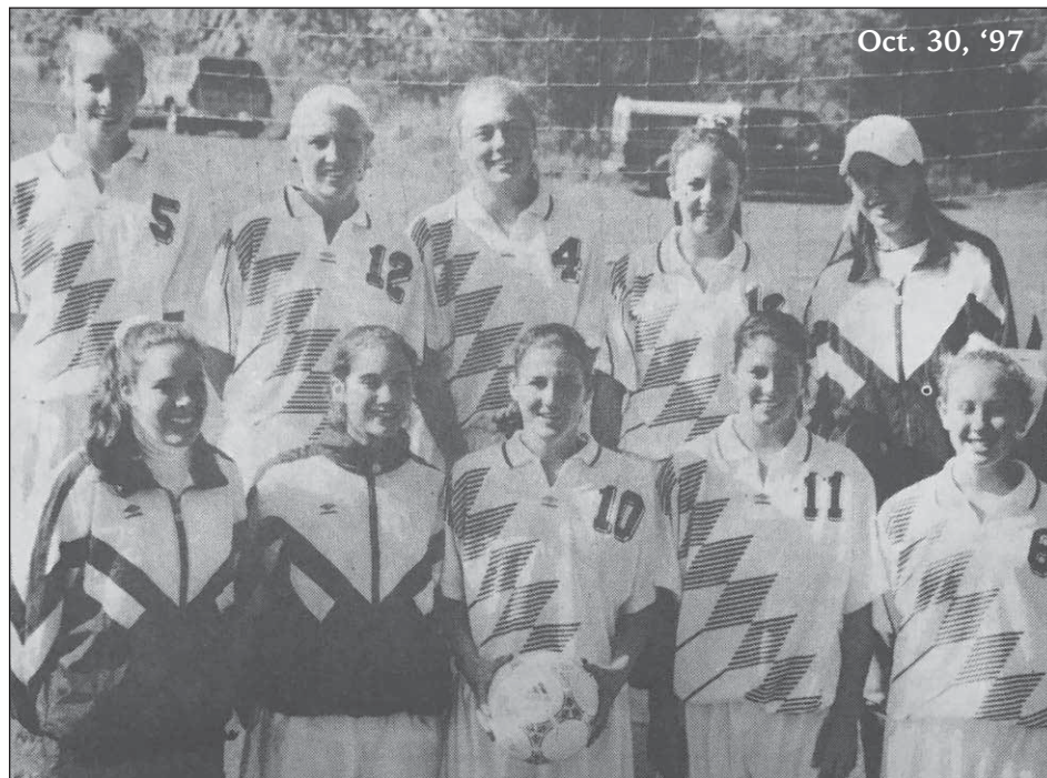
Oct. 30, '97

October 29, 1998 — Nearly four decades after he became the first American to orbit the Earth, Senator John Hershel Glenn, Jr., is launched into space again as a payload specialist aboard the space shuttle Discovery. At 77 years of age, Glenn was the oldest human ever to travel in space. During the nine-day mission, he served as part of a NASA study on health problems associated with aging.