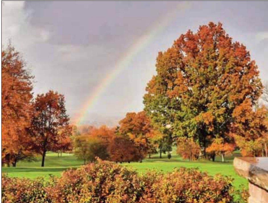
A BEAUTIFUL RAINBOW was spotted over the fall foliage at Westbrook Country Club.

Der Dutchman in Bellville was also included in the efforts of their corporate office, Dutch Hospitality Group which won a regional RUBY Award. Their Spirit of Community submission focused on serving the community and employees.