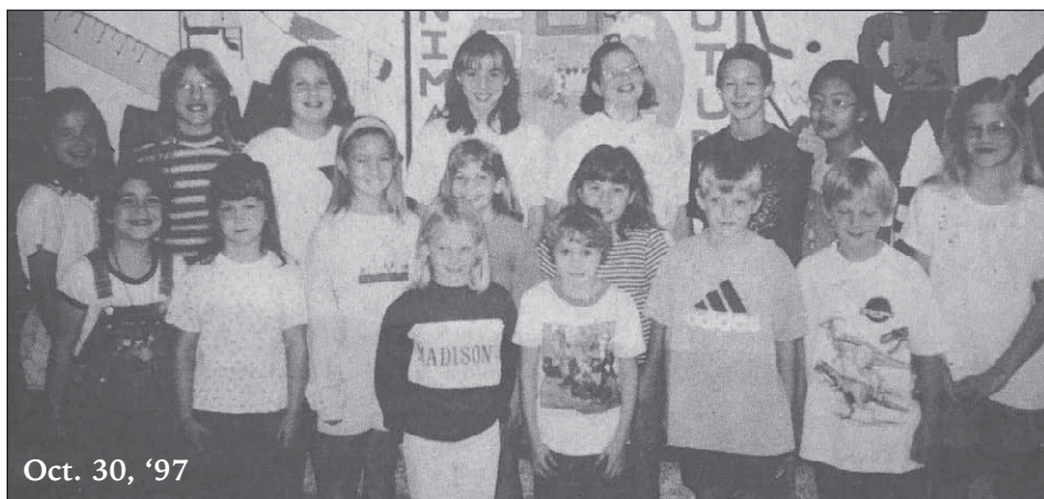
Oct. 30, '97