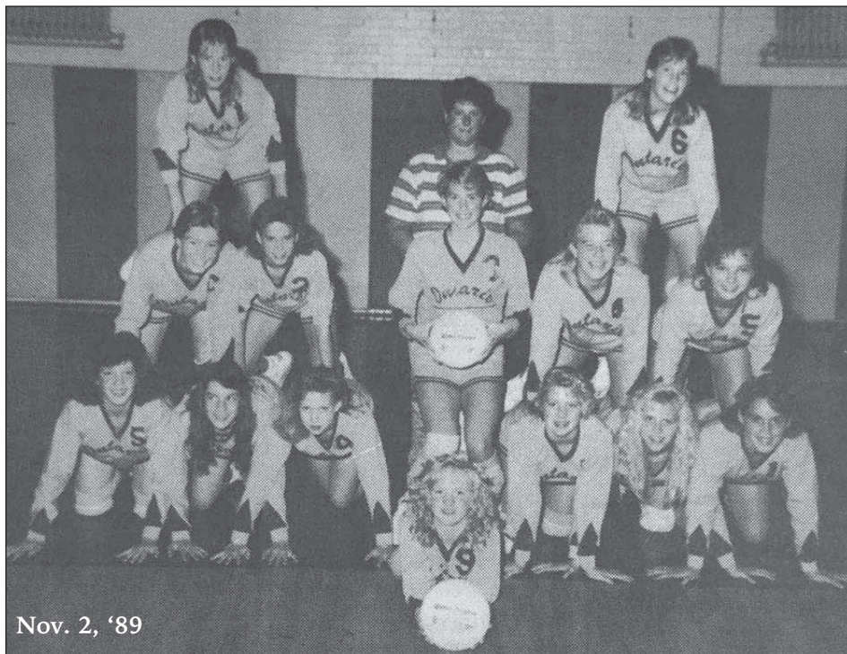
Nov. 2, '89